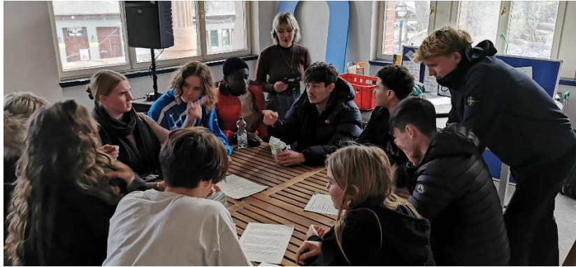
One of the groups has taken the challenge to make soap .